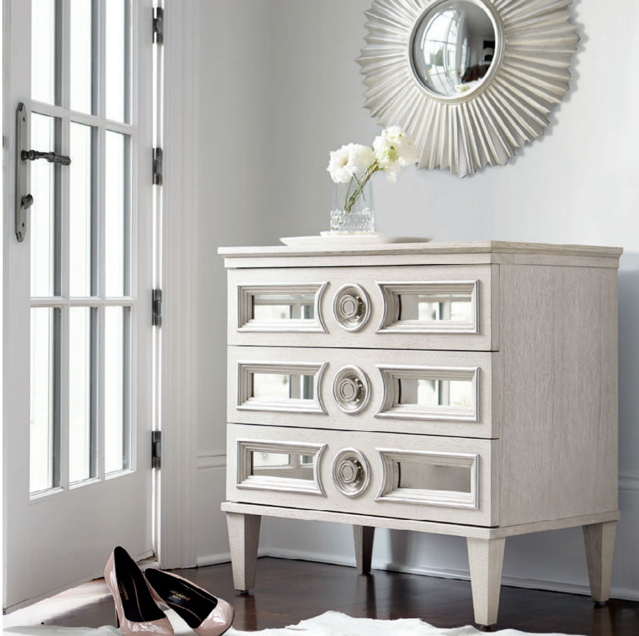
SHOWN: 399-231 Bachelor's Chest 399-230 Bachelor's Chest 399-335 Round Mirror